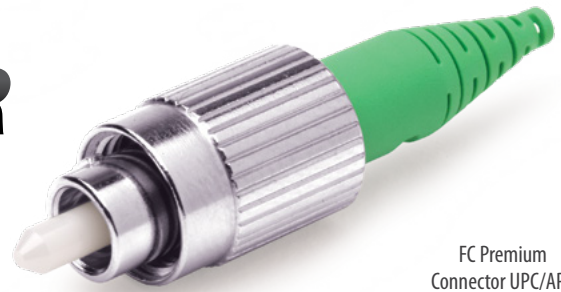
FC Premium Connector UPC/APC

SENKO's FC Premium Connector Series features a vibration-resistant threaded coupling that surpasses GR-326-CORE standards and meets Grade B IEC61753-1 random mating requirements. Available in UPC or APC polishes, it offers superior low loss single-mode performance with typical insertion loss of 0.05 dB against the master. It includes a four-direction tuning ferrule to improve random mating insertion loss and accommodates cable diameters from 900 µm to 3 mm. SENKO's Premium FC Connector is ideal for quality, performance, and reliability.