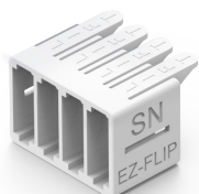
Plastic Quad Gang-Clip SN EZ-Flip Connector