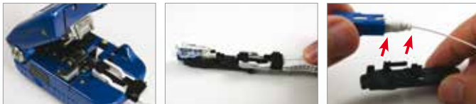
▶ 1 Cutting Fiber ▶ 2 Inserting Fiber ▶ 3 Take Out Connector

The SENKO XP Fit Plus is a pre-polished, pre-assembled connector compatible with standard SC and LC connectors. No epoxy is required as an internal mechanical grip effectively holds the fiber in place and can be installed in under two minutes. Without polishing or adhesives, the XP Fit Plus makes on site installations quick and easy, diminishing the need for epoxy curing and hand polishing at the work site. The XP Fit Plus comes with an assembly jig and fiber holder for 250µm and 900µm tight buffered fiber, ensuring accurate alignment and fiber cleave when terminating.