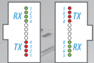
DUAL MPO (DR4)

Many MPO connectors on the market are too bulky for dual-interface transceivers. SENKO has engineered dual MPO connectors designed to match the precise QSFP-DD footprint with a "belly to belly" configuration. The user-friendly push-pull tab at the rear, streamlines connector insertion and removal within these confined spaces.