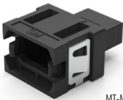
MT-MPO Standard Adapter