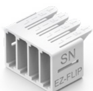
Plastic Quad Gang-Clip SN EZ-Flip Connector